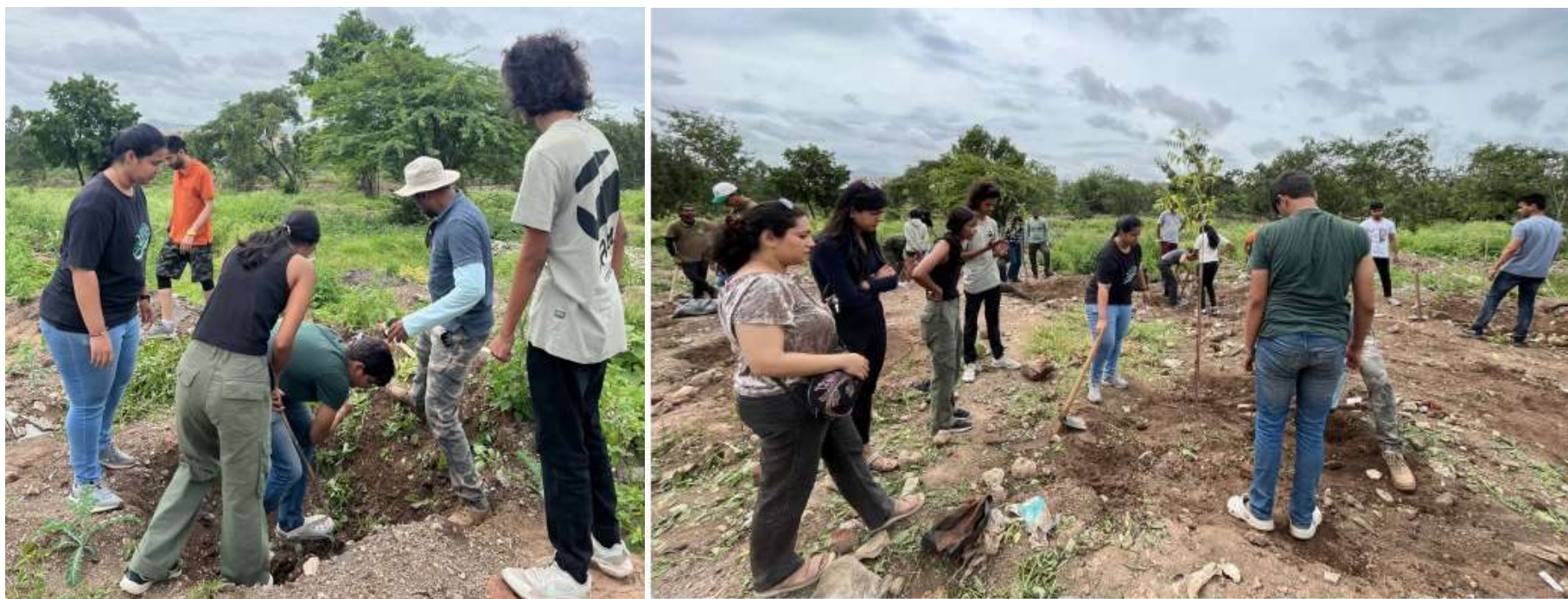
Students planting trees at Anandvan extension 04 (Off-campus drive)

trees are planted and maintained by different studios, fostering a sense of responsibility and environmental stewardship among students.