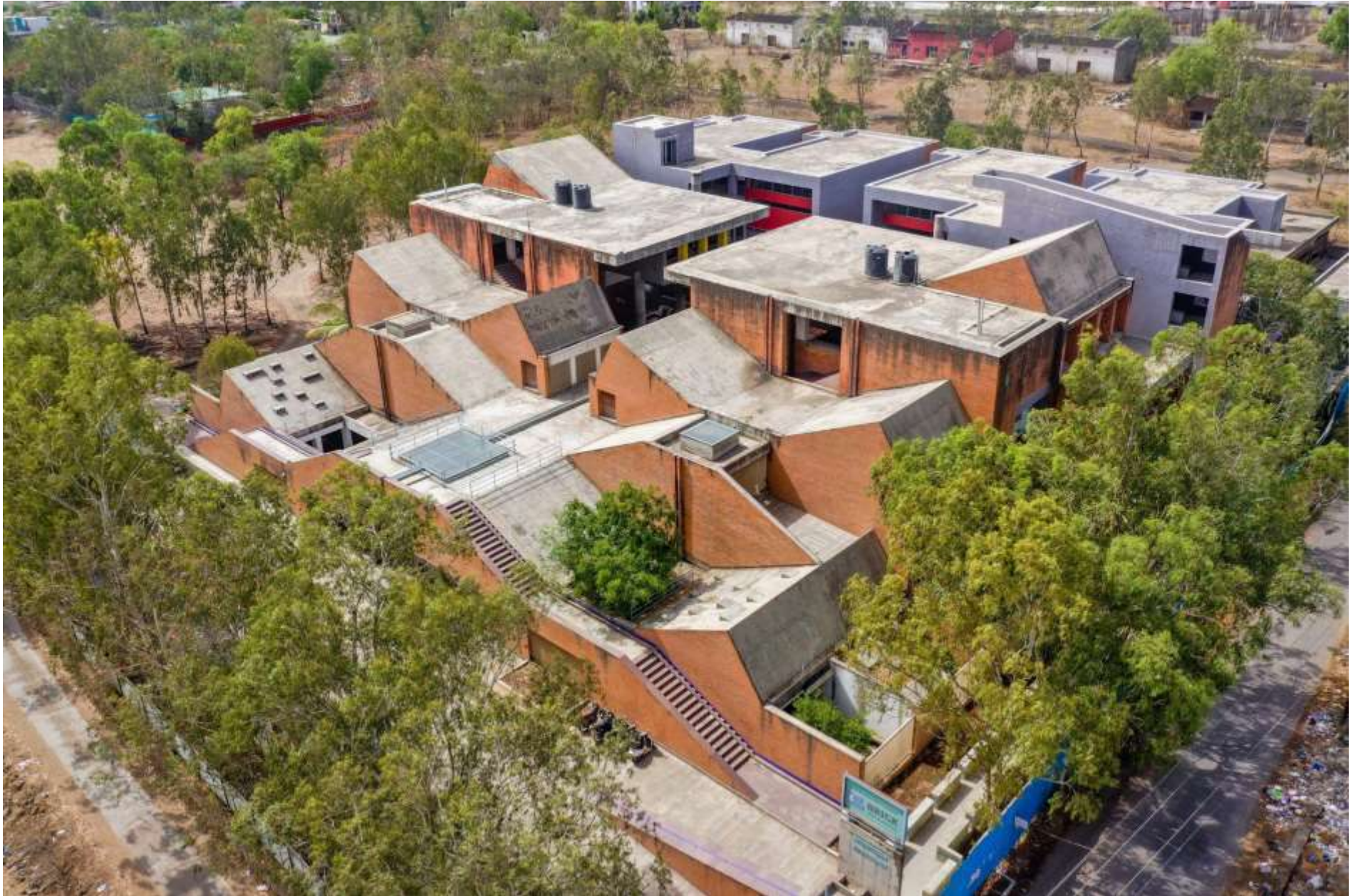
AERIAL VIEW OF GREENERY IN CAMPUS